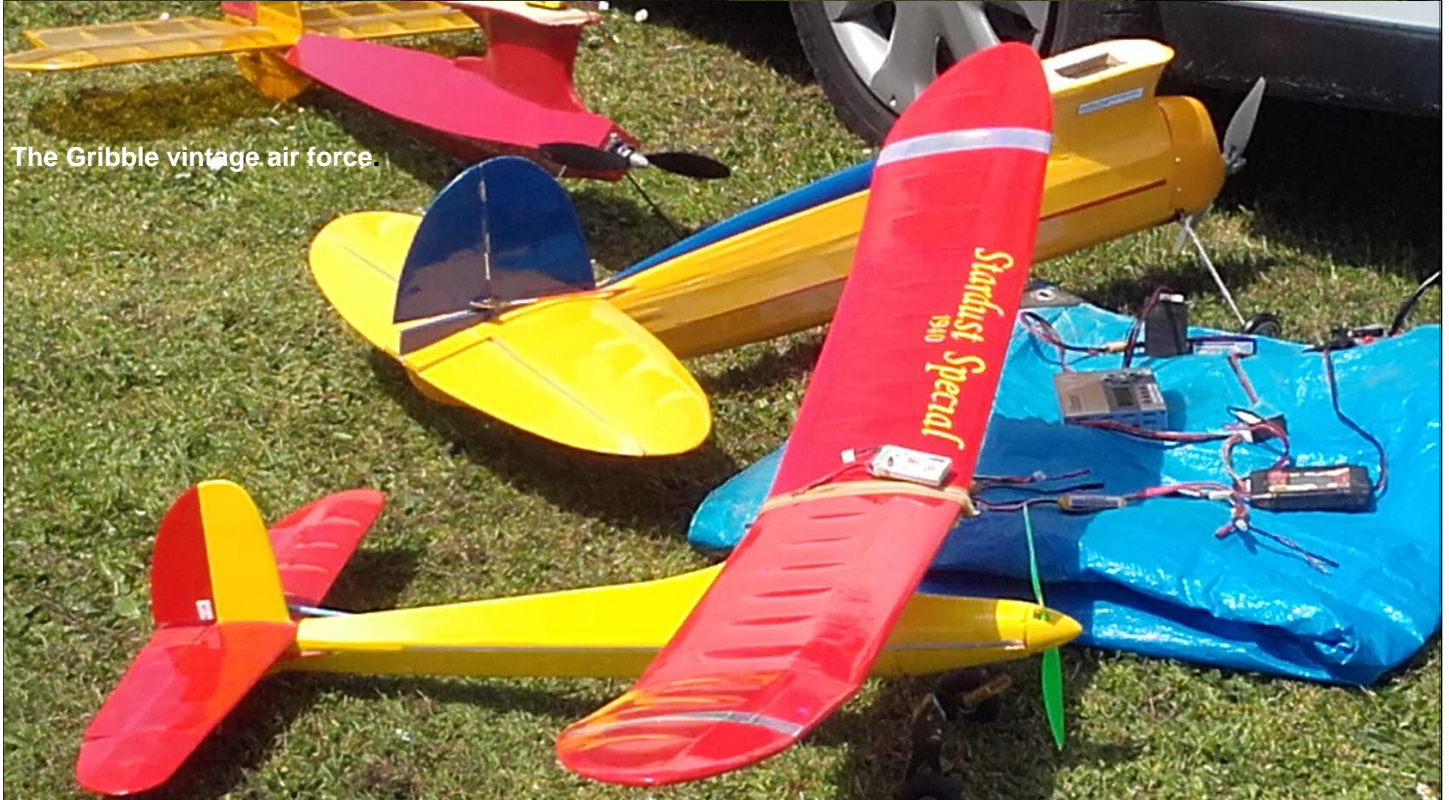
The Gribble vintage air force.